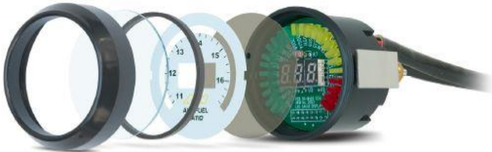
Figure 11. Gauge assembly

When re-assembling the gauge the bezel should be snug. Do not over-tighten the bezel when re-assembling the gauge. (Figure 11)